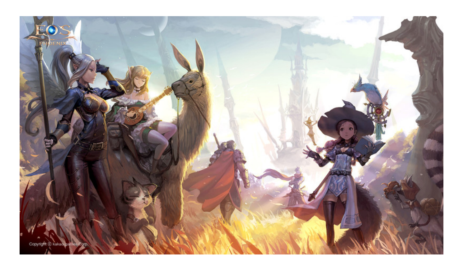
Land Of An Endless Journey Free Download Game Hacked

Download >>> <a href="http://bit.ly/2NIP1gx">http://bit.ly/2NIP1gx</a>